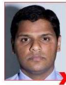
Shadows on image and background