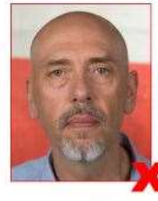
Background not plain