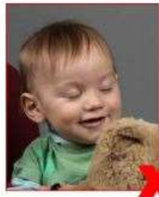
Eyes not open/toy visible