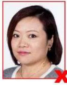
Side on to camera