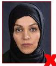
Background too dark