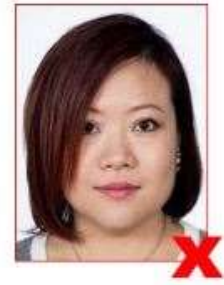
Hair obscuring face