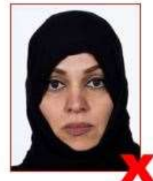
Eyes/edges of face obscured